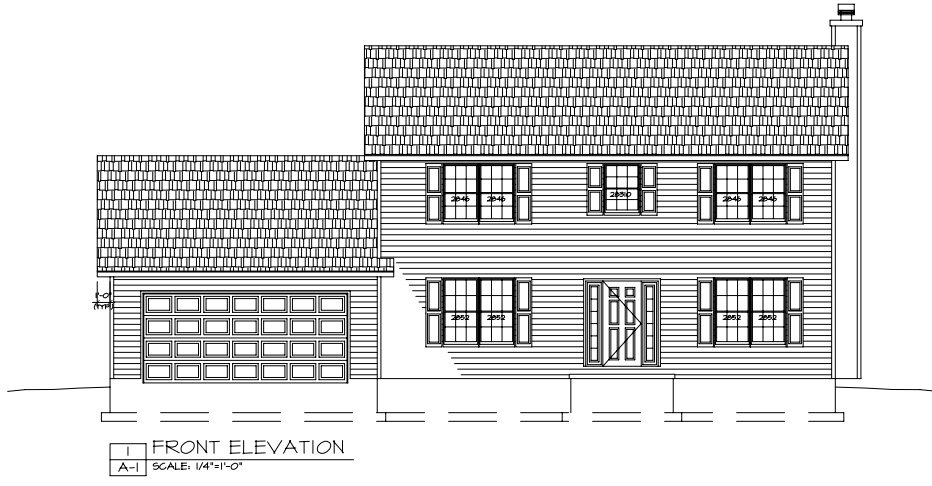
1 FRONT ELEVATION A-1 SCALE: 1/4"=1'-0"

GALLIVAN'S DRAFTING & DESIGN (217) 202-5998